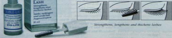
Strengthens, lengthens and thickens lashes

This revolutionary European product made from natural proteins promotes healthier, stronger lashes with just three weeks of bedtime applications! Simply brush on clear DoubleLash at bedtime and you will have noticeably longer, thicker and healthier lashes! This gentle formula won't irritate even sensitive eyes, and also works to restore thinning eyebrows. 30 oz. Once DoubleLash works its magic, you may wish to try its sister Waterproof Mascara product. This protein enriched European formula protects your lashes and provides an enhanced soft and silky appearance. The included curved brush will further lengthen and thicken lashes. Best of all, it's completely waterproof! Quick drying, won't smear. 38 oz. 1090A DoubleLash $24.95 1835A Waterproof Mascara $24.95