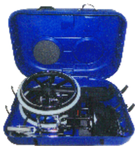
504-A for manual or shower chair.