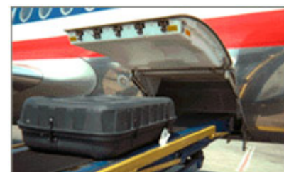
504-A loading into plane cargo-hold.

Six million wheelchairs take to the skies each year and only five million complete their journey intact. Half of all frequent wheelchair flyers have had to contend with damage to their mobility devices on a trip - so many, that complaints about wheelchair damage rank among the top ten Department of Transportation issues related to treatment of people with disabilities.